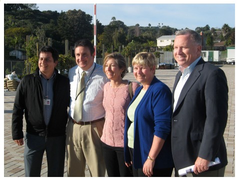
ICOC Members visited the new Student Drop-Off Area on the Kate Sessions Elementary School

The ICOC subcommittees conducted meetings and activities: